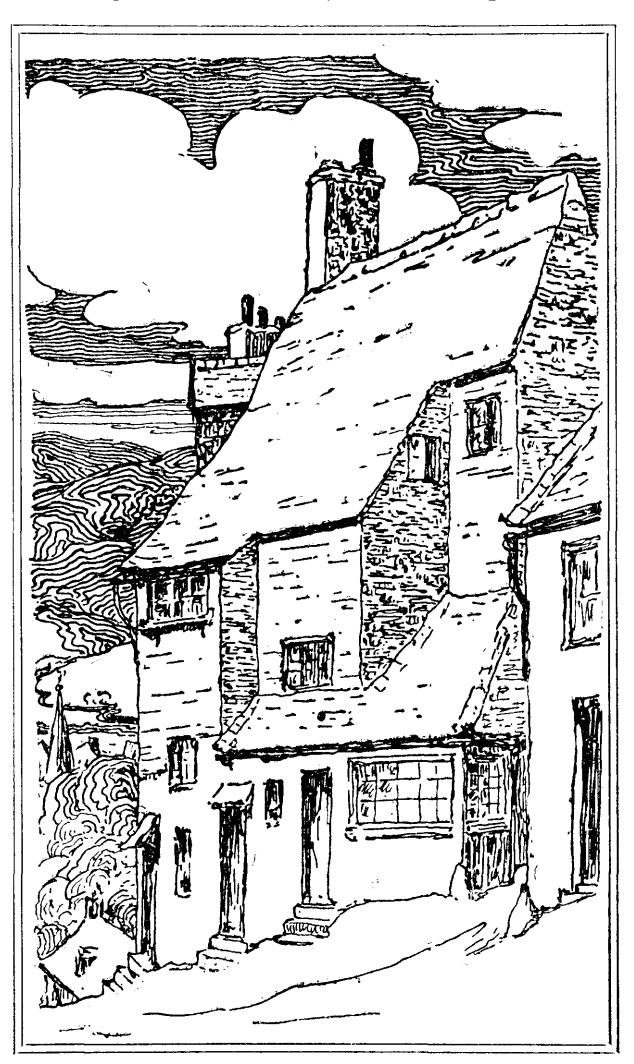
of all ages, for in almost every room lived a poor man and his wife and ever so many children. The old carved wooden figures and the heavy old wooden beams had seen many sad sights since the old Baron's merry days—had seen poor little sick children, and pale women weeping, and strong men groaning, because of all the sorrow and sadness of life.

The garret window was at the top of a very queer old house, in a queer old street, in a quaint old town in Germany, and it was in the very poorest part of the town now. But it was a very lovely old house, and a very rich old Baron had lived there long ago. But now, instead of the Baron and his lady and his lovely daughters living in the old house, there were quite a number of people