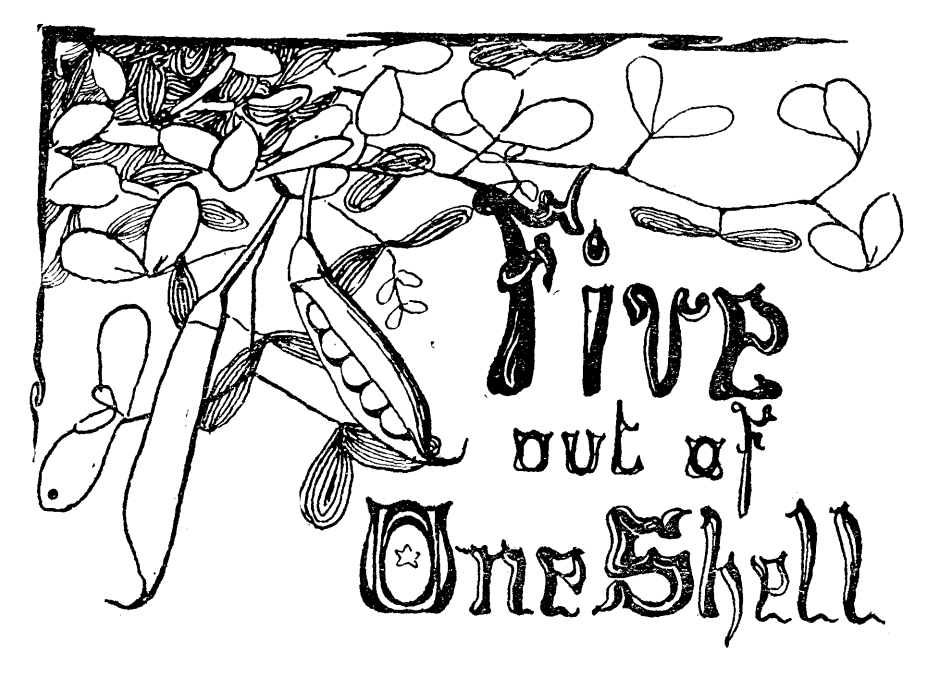
by Kate Lambert

HERE were just five of them, in one shell, and they all lay in a row as cozy as could be, just as if they were all tucked up in their little beds, and indeed they were cozily packed up in their own little green home. They were a bright green color, and their little house was a bright golden green, and they were five little sweet-peas in one pod.