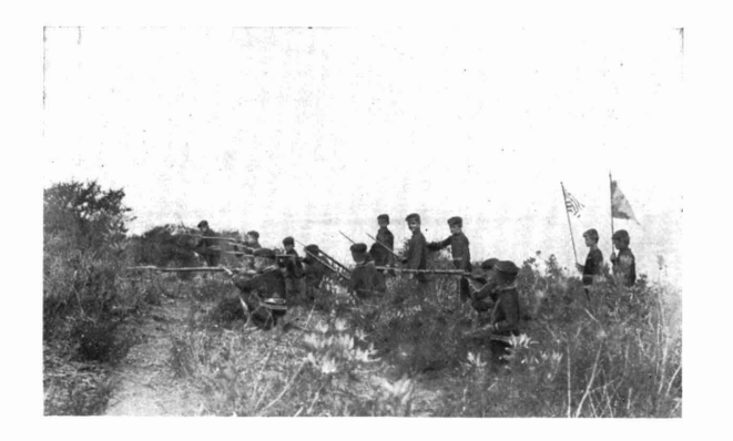
RAJA YOGA BOYS OF LOMA-LAND ON THE FIRING LINE

cluding Ancient and Modern Languages, Mathematics, all English subjects, Drawing, Music, Natural History, Astronomy, Botany and other sciences, etc. The boys are al-